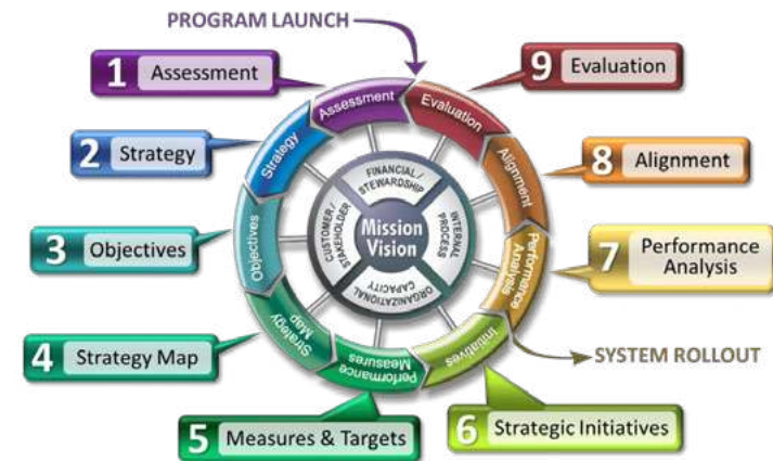
Figure 1. Nine Steps to Success Framework