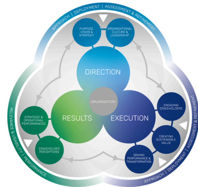
The EFQM Model

On this course, you will gain access to EFQM's online platform, AssessBase, an intuitive platform to support your organisation as it goes through the assessment process.