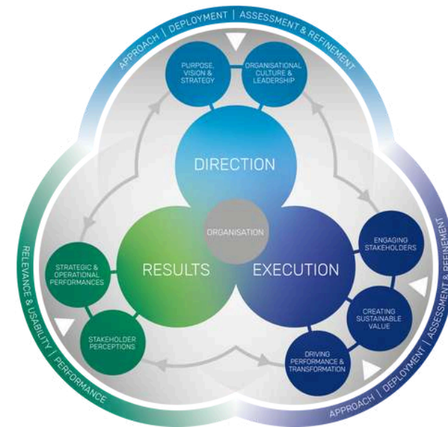
The EFQM Model

On this course, you will gain access to EFQM's online platform, AssessBase, an intuitive platform to support your organisation as it goes through the assessment process.