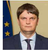
Andrei Spînu Minister for Infrastructure Government of Moldova