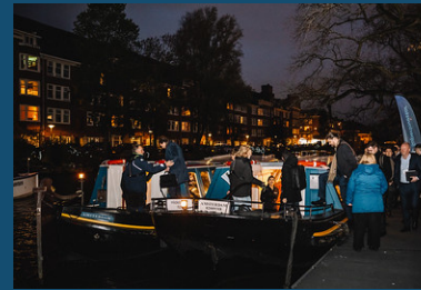
Riverboat Cruise Reception £12,000