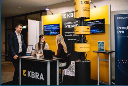
Exhibition Booth £3,000