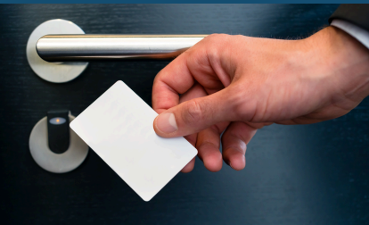
Keycard Sponsorship £9,000