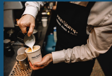
Barista Sponsorship £12,000