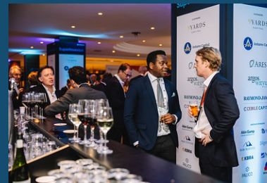
Drinks Reception Sponsorship £13,000