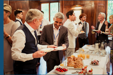
Investor/Issuer Breakfast Sponsorship £12,000