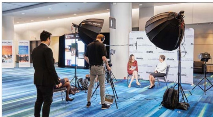
Images shown are for illustration purposes only and may change for a similar item without notice.

in RealNews the Canadian Real Estate Forums national digital biweekly newsletter when the Forum is advertised if this session promoted - a distribution of 13,000