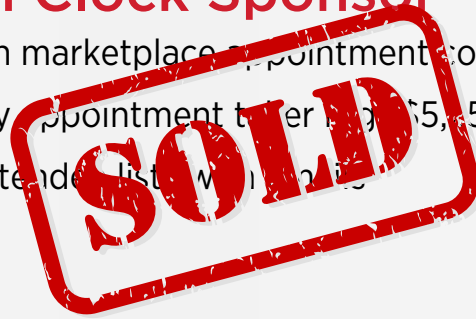
Table Tent Sponsor